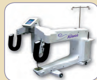
HQ 18 AVANTÉ®