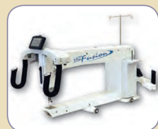
HQ 24 FUSION®