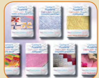
Quilters Academy® DVD SERIES