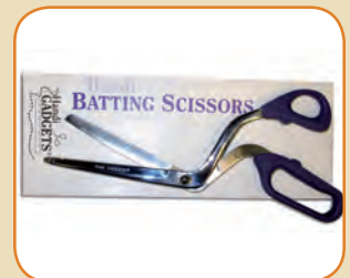
HQ BATTING SCISSORS